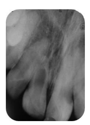
Figure 2: Pre-operative radiograph showing internal resorption in 11

3D accuitomo was used to evaluate the true information of resorptive lesion. The CT showed perforation around 4mm in height and 3mm in width in the labial cortical plate; and also the resorptive defect in tooth was around 6mm in height, 3mm in width, and oval shaped; and the perforated site was in the middle of the distal direction around 3mm in height and 3mm in width (Figures 3 and 4).