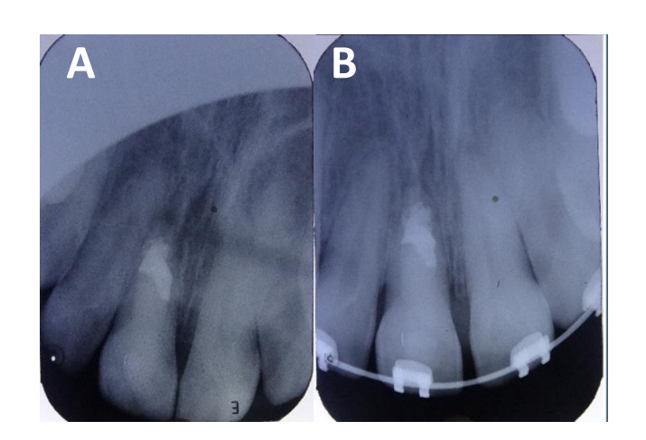
A) 1 year follow up radiograph B) 2 year follow up radiograph showing periapical healing.