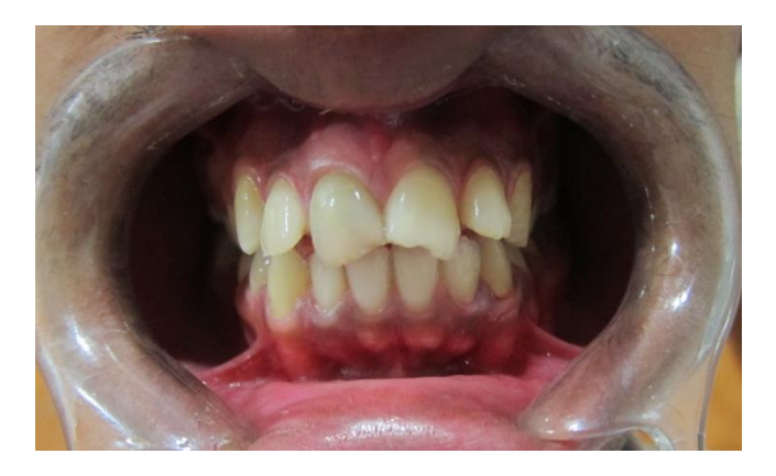
Figure 1: Pre-operative clinical representation

Clinical examination revealed that the maxillary permanent right central incisor was sensitive to percussion and also showed mild mobility with normal probing depth. There was a buccal swelling on the maxillary vestibular region with a sinus tract (Figure 1). The tooth presented a negative response to pulp testing. The radiographic examination revealed a well-defined radiolucent area suggesting an internal root resorption at the middle third of the root canal as well as the presence of a perforated defect on the distal side of the root (Figure 2). Based on clinical and radiographic findings, the lesion was diagnosed as a perforating internal root resorption. A treatment plan was presented to the patient including nonsurgical root canal therapy and repair of the perforation with Biodentine.