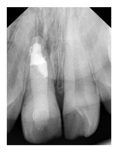
Figure 6: Immediate postoperative radiograph showing obturation with an apical seal of warm gutta percha followed by biodentine

After 2 months, the tooth was restored with composite resin (3M ESPE). The patient was re-examined periodically at 1 year and 2 years for post treatment observation. (Figure 7A-7B).